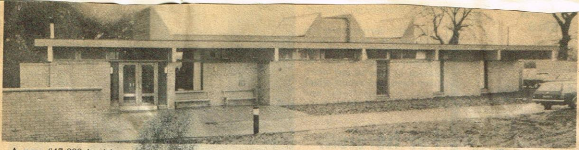
● The new £47,000 Woolpit health centre.

A new £47,000 health centre—first of its kind in West Suffolk—was officially opened at Woolpit on Wednesday.